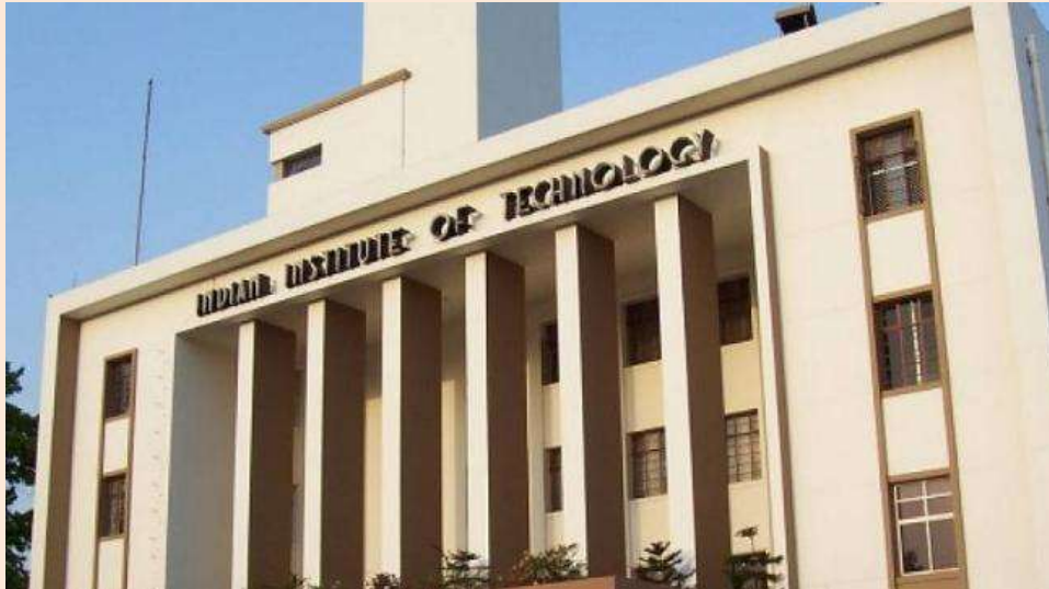
IIT Council to scrap off JEE Advanced

The education system of Indian Institute of Technology(s) is soon to be revamped in the upcoming IIT Council meeting.